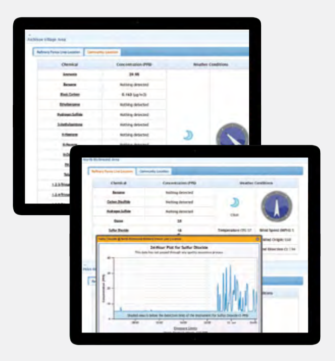
ABOVE: The original site for accessing data from community monitors in Richmond allows users to view only the past 24 hours of readings and offers no way to add comments or context.

Community groups should not be expected to create and maintain the infrastructure necessary for making sense of real-time monitoring data without substantial support from government, foundations, or other well-established institutions.